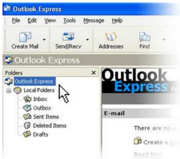
Outlook Express list of folders